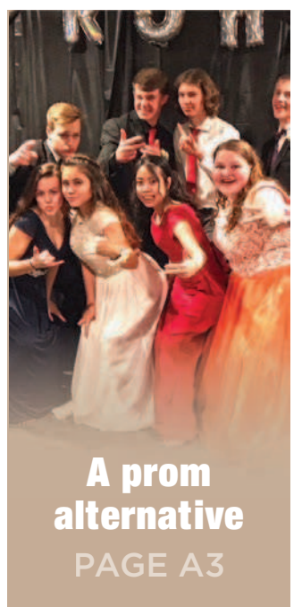
A prom alternative PAGE A3