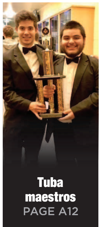
Tuba maestros PAGE A12