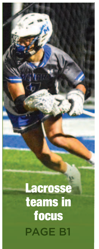
Lacrosse teams in focus PAGE B1