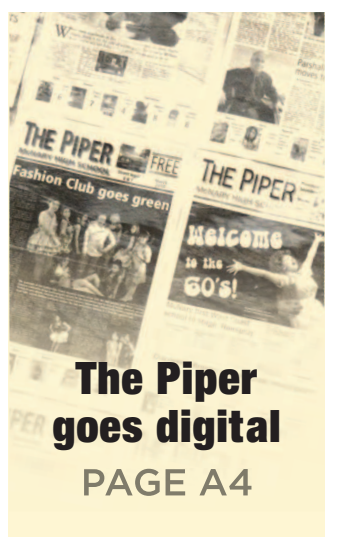
The Piper goes digital PAGE A4