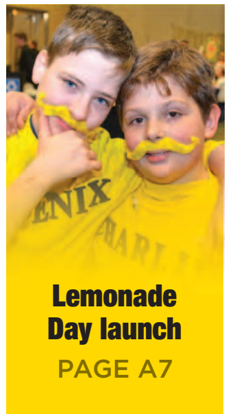
Lemonade Day launch PAGE A7