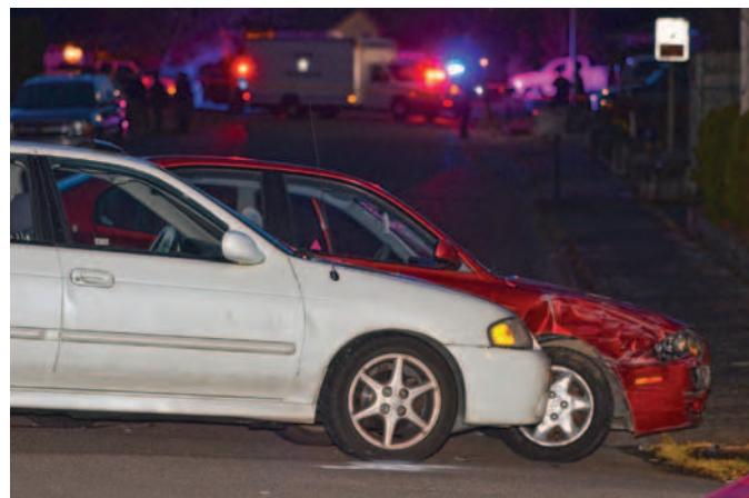
An armed robbery led to a car crash and then the shooting and killing of the suspect on Springtime Court Northeast on Wednesday, March 14.