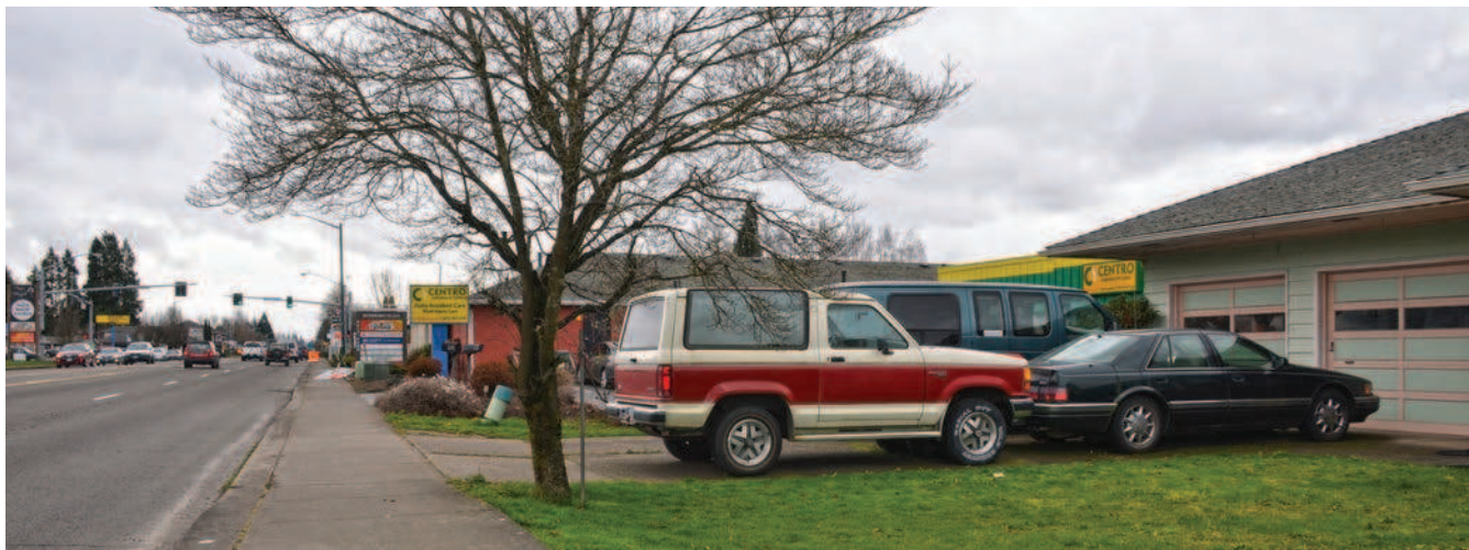
River Road and Churchdale Avenue.