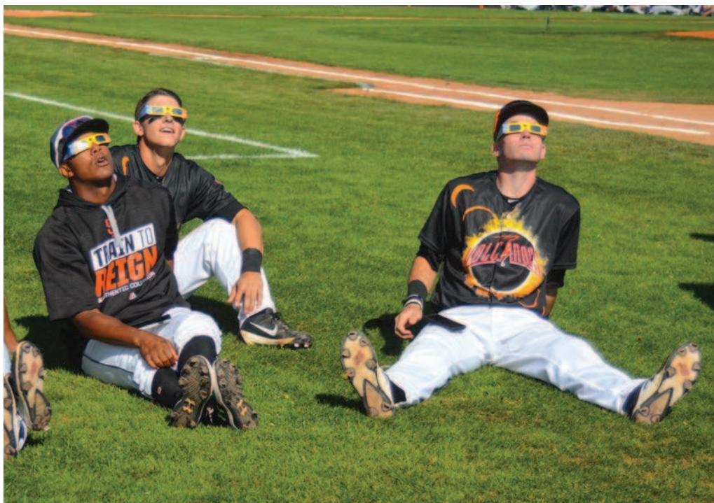
File Salem-Keizer Volcanoe baseball players look up at the eclipse just before totality during a delay on Aug. 21.

The game, which the Volcanoes lost 9-5 to the Hillsboro Hops, was delayed for 58 minutes after the top half of the first inning due to the eclipse.