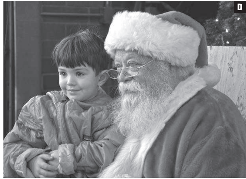
The Keizer Fire District served up hundreds of breakfast plates on Sunday, Dec. 10, as part of the annual Santa breakfast.