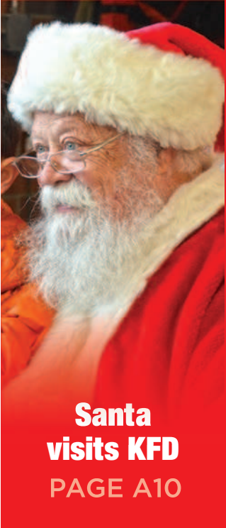
Santa visits KFD PAGE A10