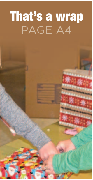
That's a wrap PAGE A4