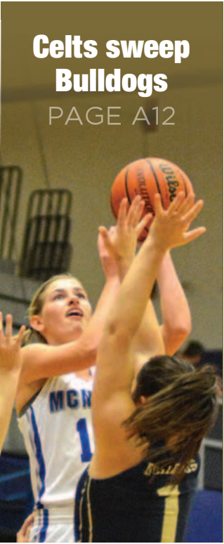
Celts sweep Bulldogs PAGE A12