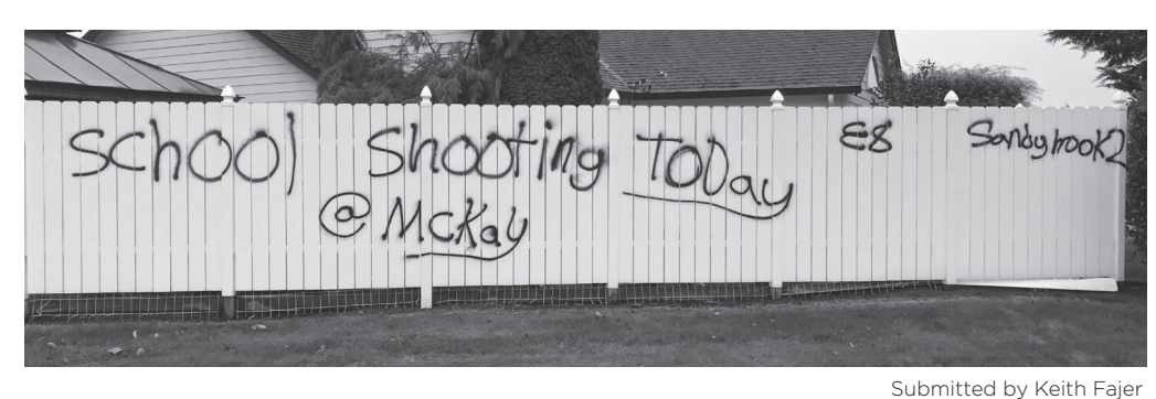
A fence on Jakewood Court was the site of several acts of vandalism.

"We have formal drills a few times a year. Our students and staff are very aware of what a Condition 1, 2, and 3 are," Jespersen said. "The kids and the staff were amazing. They responded in probably 15-20 seconds. We had 2,000 students that were where they needed to be."