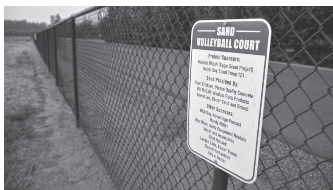
A sign near the Keizer Rapids Park volleyball courts commemorates the efforts on a project that has since been replaced.