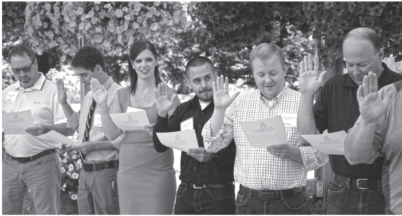
ABOVE: Some of the 2017-18 Keizer Chamber of Commerce board members take the oath of office. RIGHT: Outgoing officers and board members were also honored at the July luncheon.