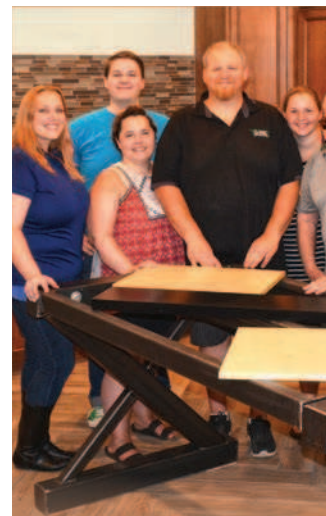
A new look for River Road business PAGE A6