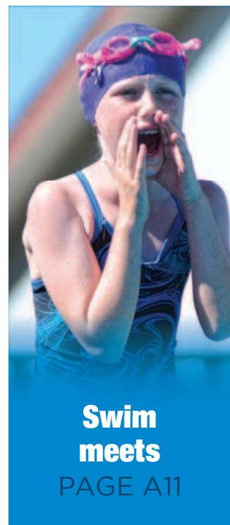
Swim meets PAGE A11