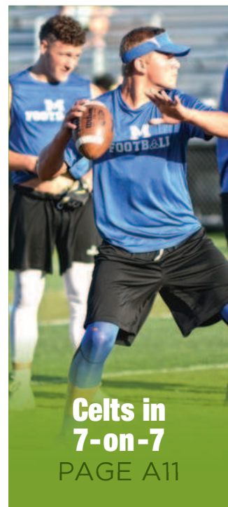
Celts in 7-on-7 PAGE A11