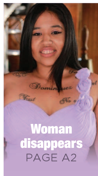
Woman disappears PAGE A2