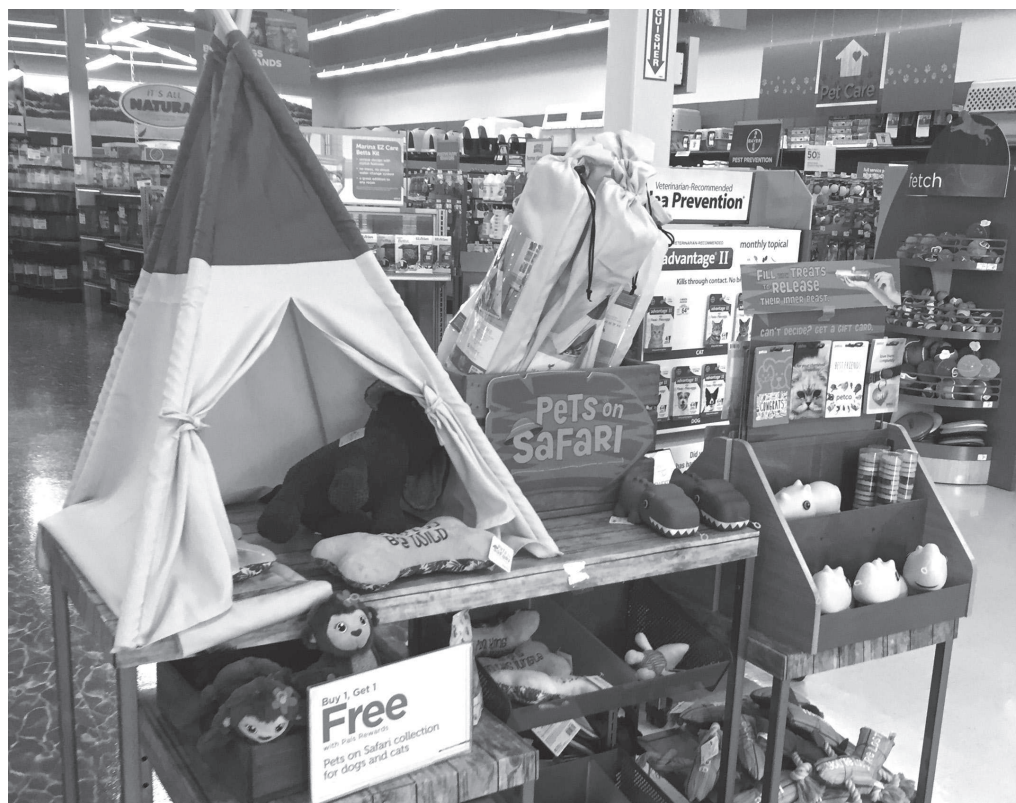
A merchandise display at Petco in Keizer Station juxtaposes the idea of a safari with a Native American sacred space.