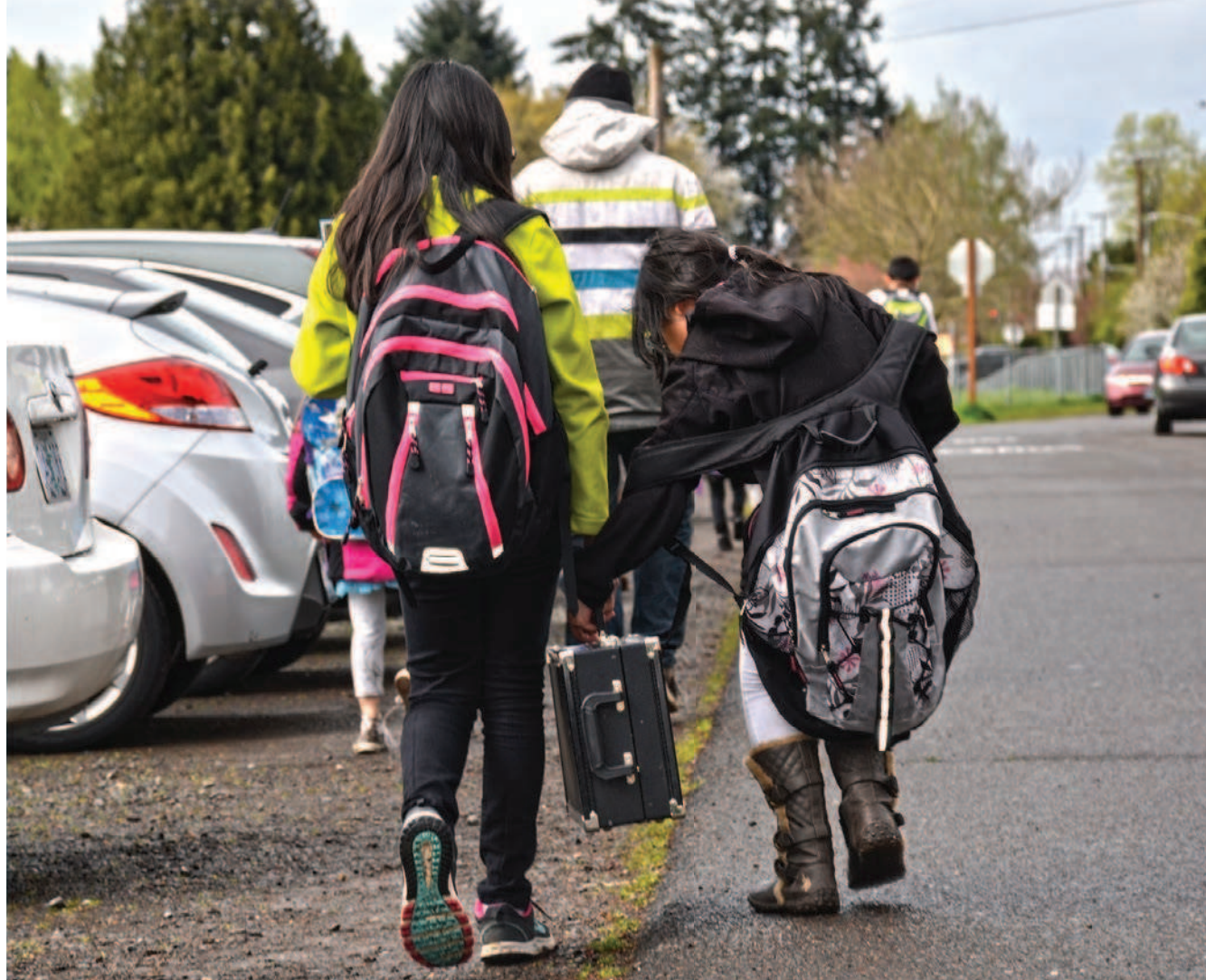
Cummings Elementary School students walk along the side of the road after the end of the school day.