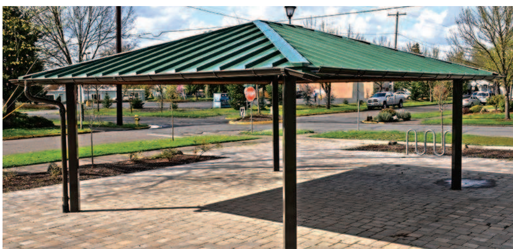
Keizer Rapids Park will get its first picnic shelter thanks to a matching grant approved last week. The shelter pictured is near Grant Community School in Salem.