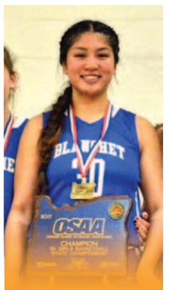
Keizer girls take state title at Blanchet PAGE A10