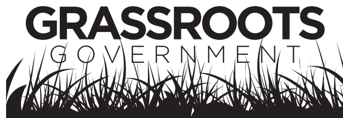
The Keizer Traffic Safety, Bikeways and Pedestrian (TBP) Committee held its latest meeting Thursday, Feb. 9. Here's what members discussed:

opportunities to meet the treatment team, tour the facility, chat with local vendors, find resources and educational material, take part in activities and refreshments, and learn more about prevention and recovery. For more information, call 971-304-7245.