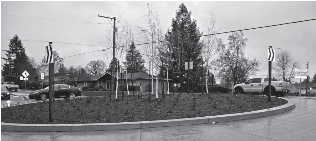
The Keizer City Council approved the placement of a public art pad in the roundabout at Chemawa Road Northeast and Verda Lane Northeast.