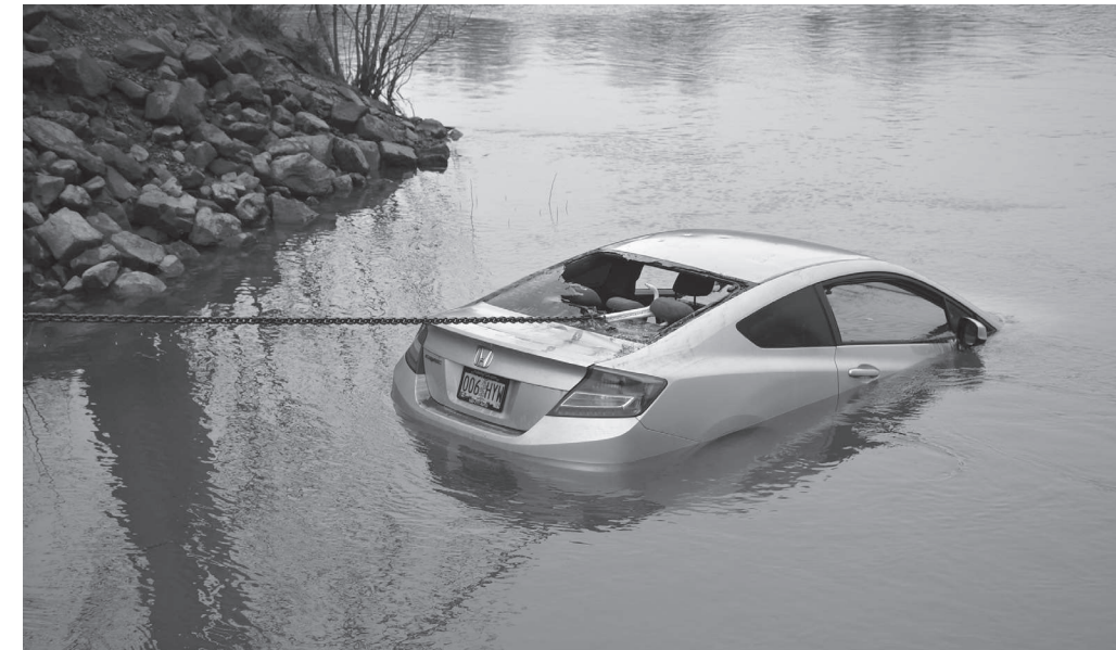
ABOVE and BELOW: A crew from Wiltse's Towing had to hook a Honda Civic three times before it was finally able to pull the car out of the Willamette River Wednesday, Dec. 28.

Artists who are exhibiting works are encouraged to at-