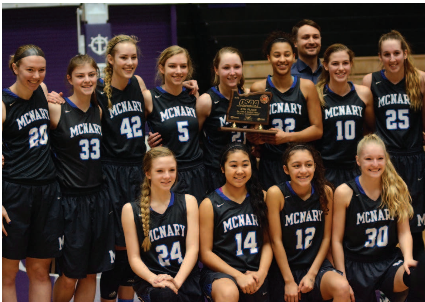
McNary's girls basketball team won a school-record 23 games, including a 57-52 victory over South Medford in overtime to finish fourth in the state in 2016.