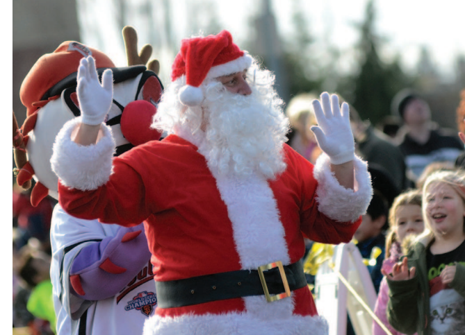
Santa Claus will be at Salem-Keizer Volcanoes Stadium Saturday, Dec. 3 from noon to 3 p.m.

Free photographs will be available of Keizer kids on Santa's lap.