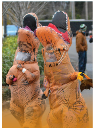
T-Rexes invade Turkey Dash PAGE A11