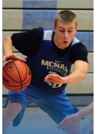
Boys hit court with purpose PAGE A12