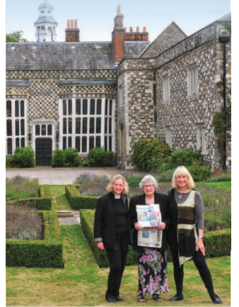
A historic KT on Vacation PAGE A10