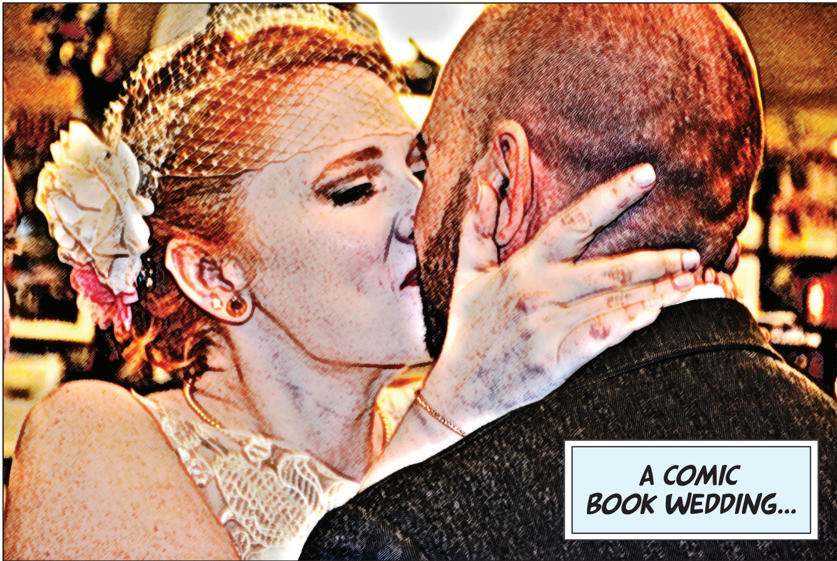
A COMIC BOOK WEDDING...