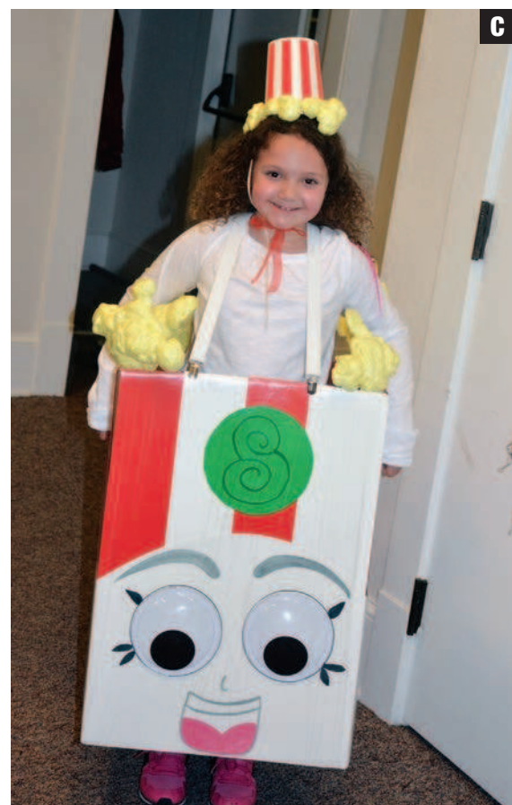
The Keizer Heritage Center had one of its best-attended Halloween nights yet Thursday, Oct. 20.