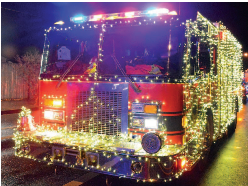
The Keizer Chamber of Commerce is planning to resurrect a holiday light parade on River Road.