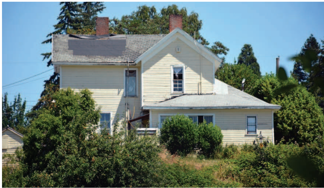
The long-standing farmhouse on Verda will either be moved through local efforts or razed to make room for apartments.