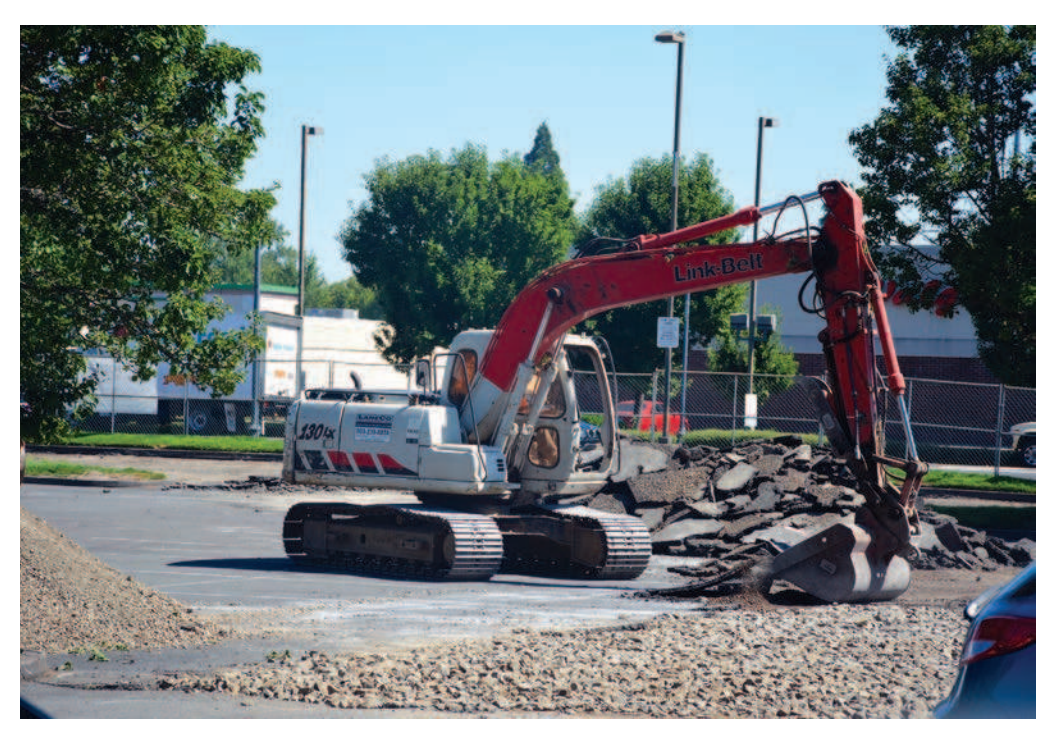
Construction crews began removing sections of the parking lot at Schoolhouse Square this week, setting the stage for a new coffee house and sandwich shop