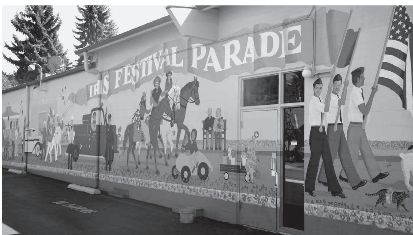
The Iris Parade mural at Town & Country Lanes will have its official dedication on Saturday, Sept. 10, at 11 a.m. The public is invited to attend.