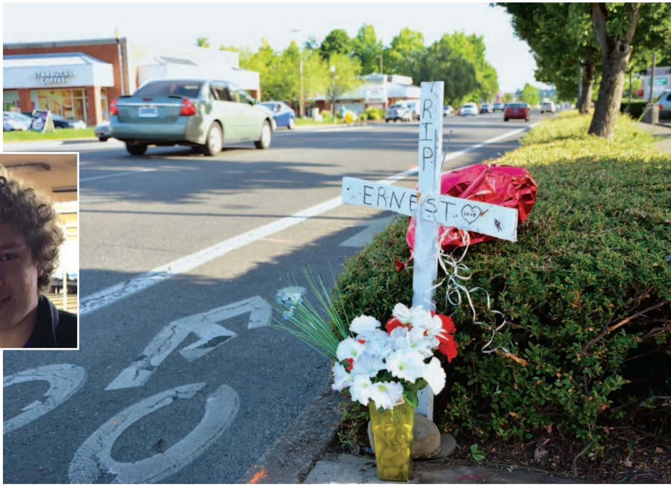
UPPER LEFT: Anthony Jon Ernest. ABOVE: A small roadside memorial was placed on the corner of River Road North and Chemawa Road Northeast in the days following the collision that killed Ernest.

relatives that brain trauma suffered in the incident was "irreversible."