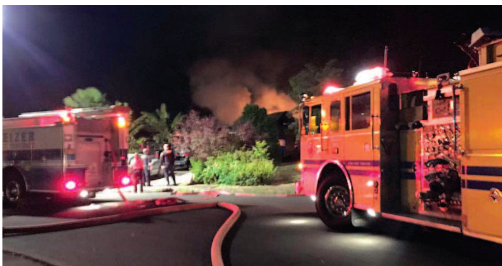
Submitted by Keizer Fire District Fire crews responded to a garage fire on Faymar Drive Northeast Monday, July 4.