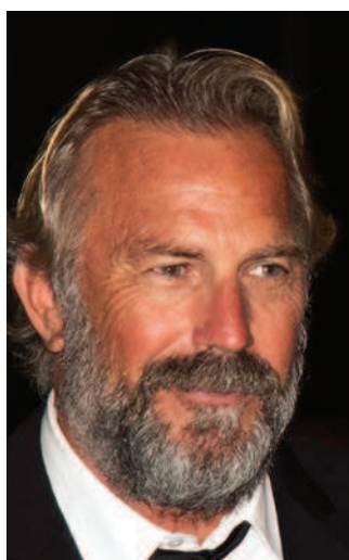
Costner, who isn't moving to Keizer, at the 2014 Toronto International Film Festival

reports of Eminem moving to Jackson, Miss., and a previous report of Costner moving to Fredericton, New Brunswick in Canada.