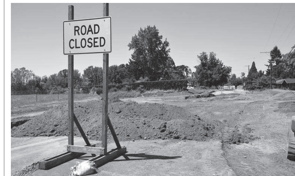
Construction crews have excavated the entire site that once was the intersection at Chemawa Road Northeast and Verda Lane Northeast. Work expected to be complete in September.