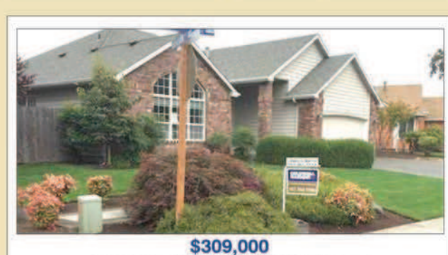
BEAUTIFUL, WELL MAINTAINED