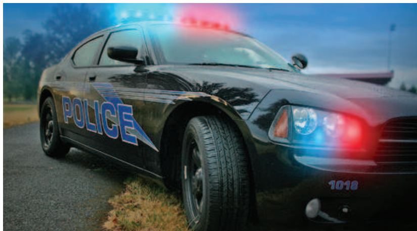
Several Keizer Budget Committee members expressed frustration last week about the lack of a new officer. More stories are on pages A2 and A9.