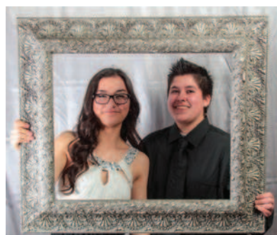
The McNary High School Air Force Junior Reserve Officer Training program held its Military Ball in April. These are just a few of the candids from the photo booth.