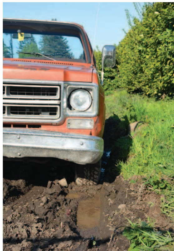
LEFT: A McNary High School student's truck is seen parking in a mudhole on MacArthur Street. RIGHT: Students park up and down MacArthur due to a shortage of parking spots in the MHS lot, which has caused angst for neighbors.

"Sandy Drive was a problem for 30 years until we solved it last year... Evidently it moved your way, which is unfortunate."