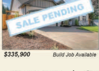
$335,900 Build Job Available