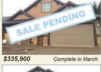
$335,900 Complete in March