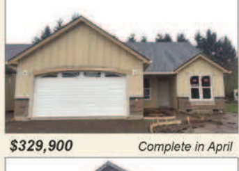
$329,900 Complete in April