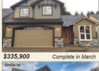
$335,900 Complete in March