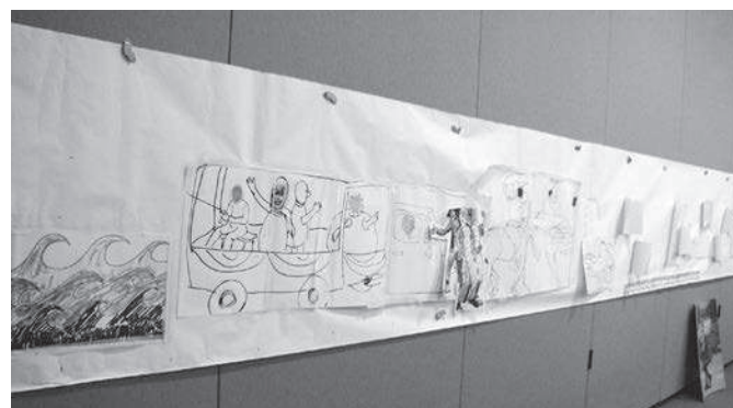
Plans continue to evolve for Keizer’s next public mural, shown here during a mural meeting in March.