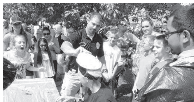
The ending of RIVERfair also means the apparent end of the good-natured pie-eating battle between the Keizer Police Department and the Keizer Fire District.

The first festival was in 2008 at Keizer Rapids Park. The event featured vendor booths, food and live entertainment. Later years saw a pet parade added as well as the RIVERfair pie eating championships that began a contest between members of the Keizer Police Department and the Keizer Fire District.