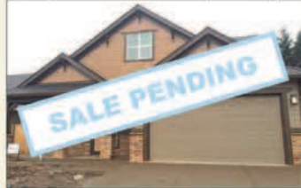
$335,900 Complete in March