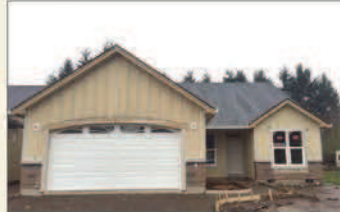
$329,900 Complete in April