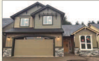
$335,900 Complete in March