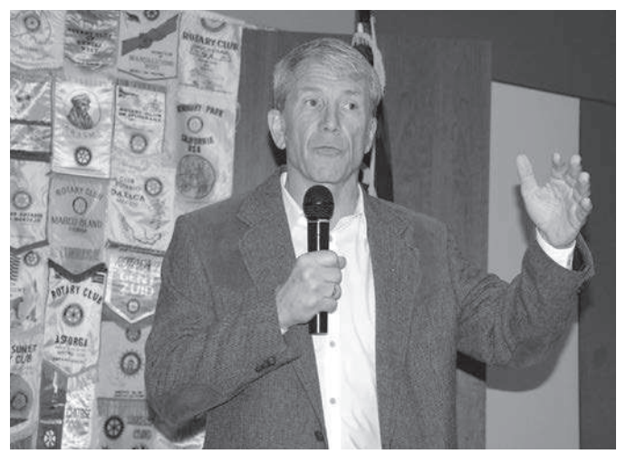
U.S. Rep. Kurt Schrader speaks at the Feb. 18 Rotary Club of Keizer meeting.

Schrader said his committee also approved legislation about toxic substances that hadn’t been updated since the 1970s and also approved a way for some new drugs and medications to get to market sooner.