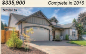
$329,900 Build Job Available