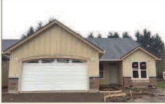
$329,900 Complete in 2016