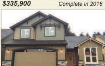
$335,900 Complete in 2016