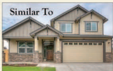
$339,900 Complete in 2016