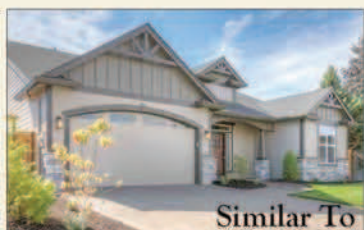
$329,900 Build Job Available