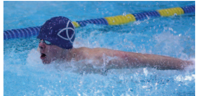
Left and above: Celtic swimmers take part in preliminary races at the GVC conference meet Friday, Feb. 12.