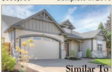
$329,900 Build Job Available