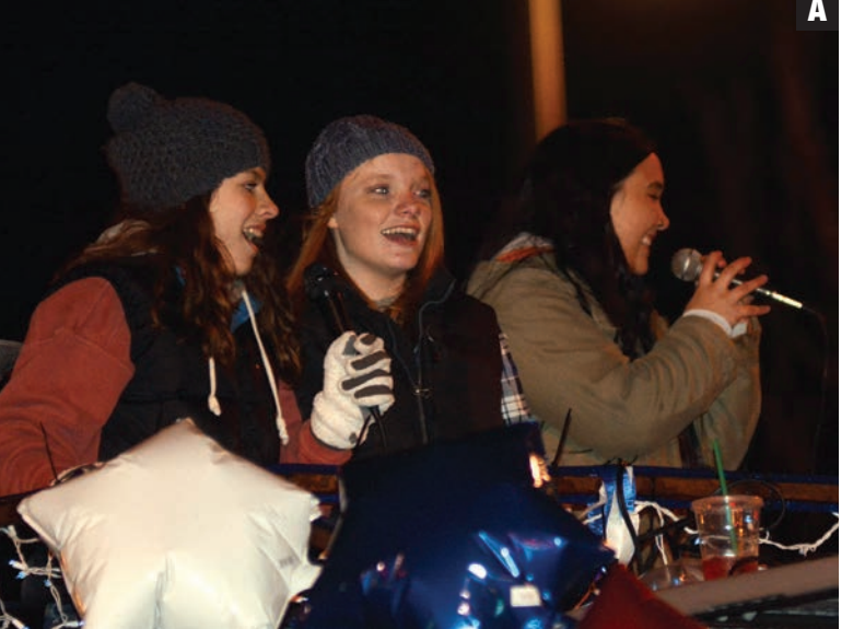
DECEMBER 18, 2015, KEIZERTIMES, PAGE A15