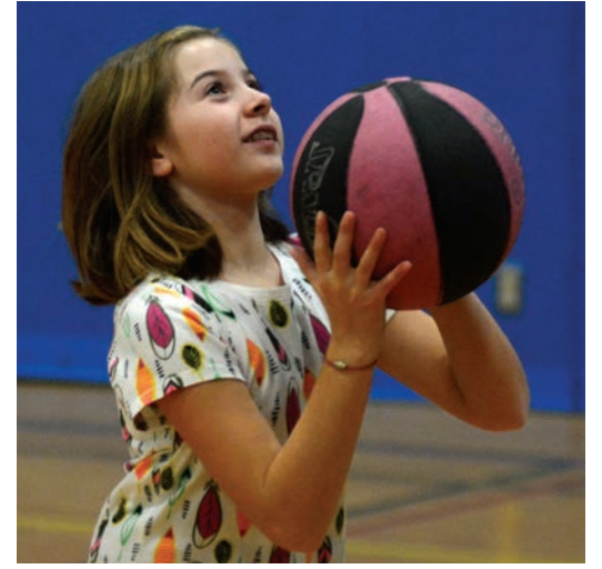
About 400 Keizer Youth Basketball Association players have spent the past four Saturdays taking part in clinics at Whiteaker Middle School.