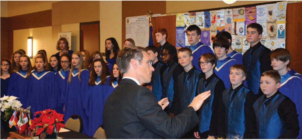
The Whiteaker Middle School choirs sang during the Keizer Rotary/Chamber of Commerce holiday luncheon on Dec. 10. The group kept singing, even after the power went out.