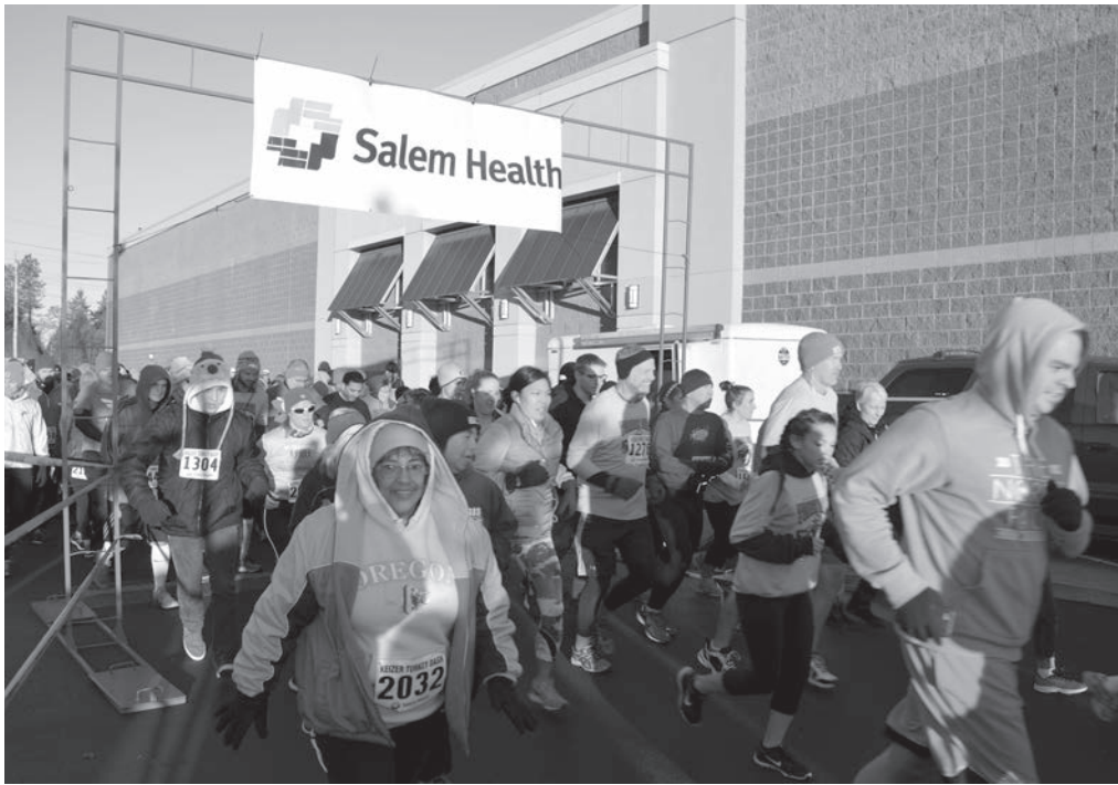
Left: Runners and walkers take off from the starting line.