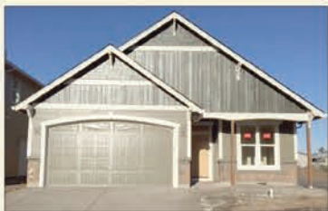
$329,900 Completion October