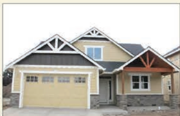
$329,900 Completion September