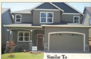
$329,900 Completion October