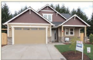
$329,900 Completion September