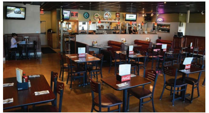
The former Porter's Pub reopened as Full Monty's Bistro and Taphouse last Thursday, Oct. 1.