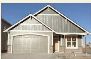
$339,900 Completion October