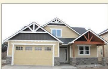
$339,900 Completion September