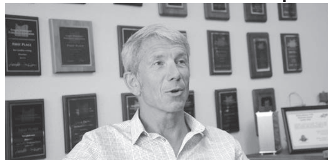
U.S. Rep. Kurt Schrader

“At the state and the federal level we need to get our