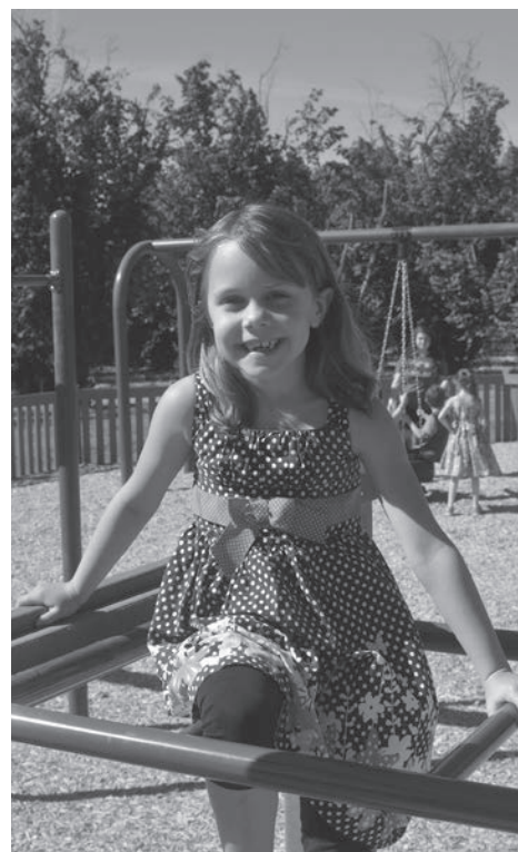
The Big Toy has been a popular addition to the Keizer Rapids Park this summer.