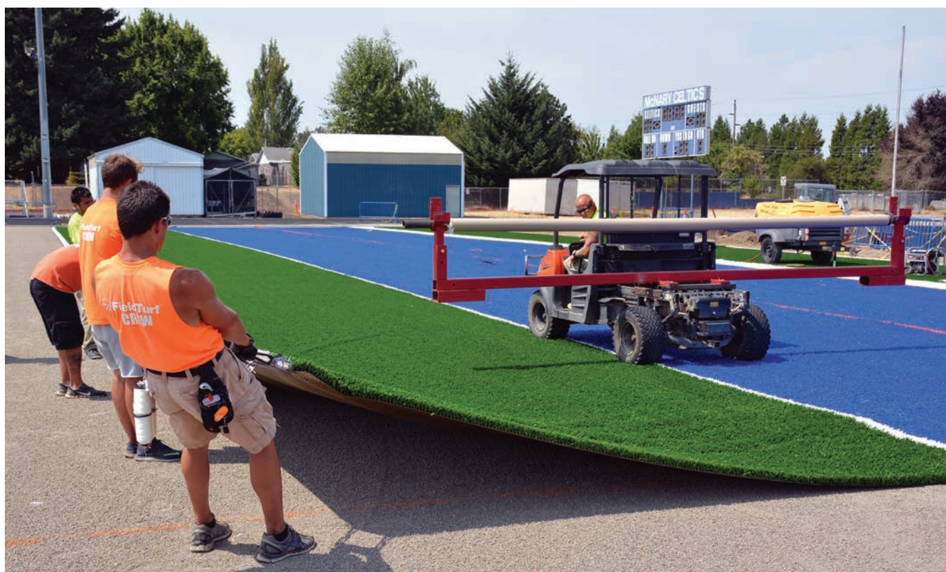
A work crew from FieldTurf stretches out a section of artificial turf at McNary High School's Flesher Field Tuesday, Aug. 11. A dedication ceremony is planned during McNary's annual Blue Day celebration Saturday, Aug. 22.