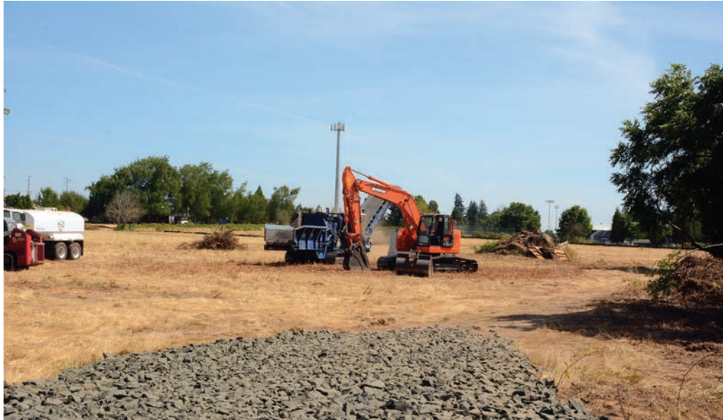
Trees are being taken down and the land cleared for an extension of McLeod Lane off of Chemawa Road, as seen July 17.