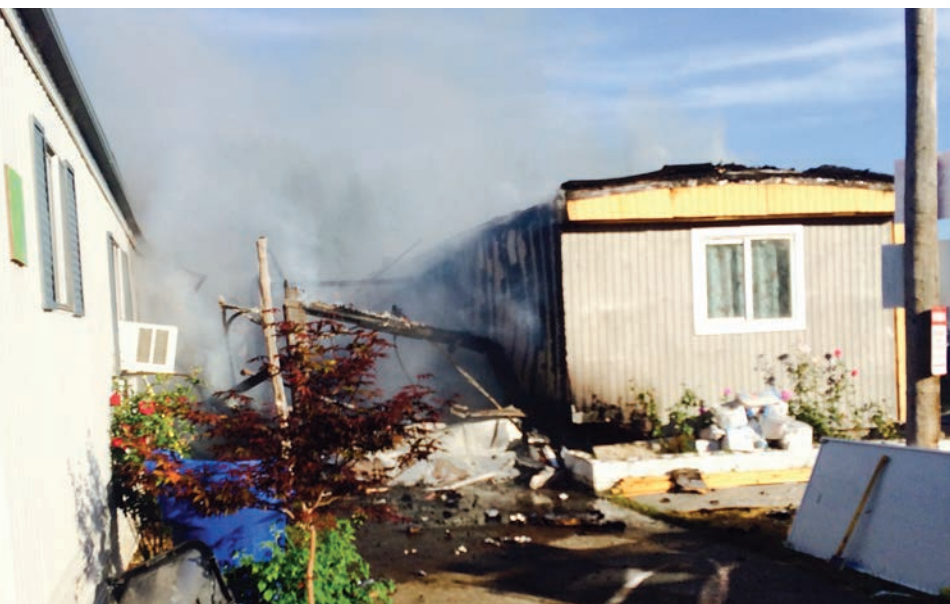
Submitted Five adults, four children and pets were displaced by this fire at a mobile home on the 2000 block of Kennedy Circle NE in Keizer on July 15. According to the Keizer Fire District, the cause is still undetermined. Damage was estimated at about $7,000 plus contents, in addition to $1,000 in damage to a neighboring home.