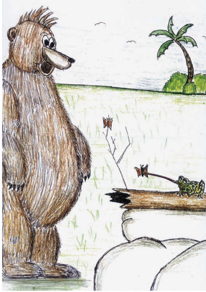
Submitted Wally Graham's illustration for the Mister Toad poem.

It's almost too easy to draw parallels between their story and Graham's first poem about