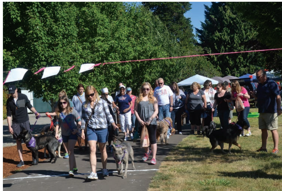
It may not have been the 4th of July, but Keizer Rapids Park was still a busy place last Saturday morning, June 20. Top: children and adults alike explore the new Big Toy play structure, which had its grand opening. Above: Walkers and their dogs start the Bark for Life event, which was a fundraiser for the American Cancer Society. For more photos of both events, please see the respective photo albums on the Keizertimes Facebook page.