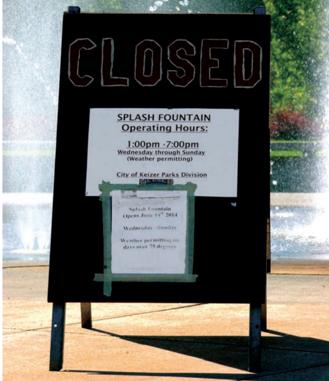
If forecasted high temperatures for Mondays and Tuesdays this summer are below 95 degrees, expect to see this sign at the Splash Fountain behind Keizer Civic Center.