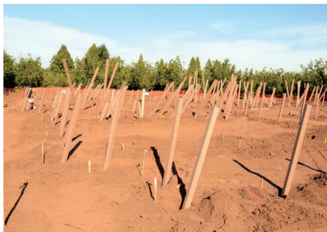
How the Big Toy site looked the evening of June 9.