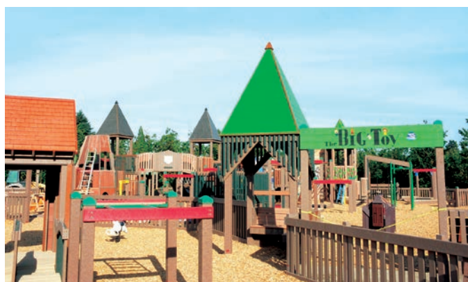
How the Big Toy site looked exactly a week later, from a similar vantage point.